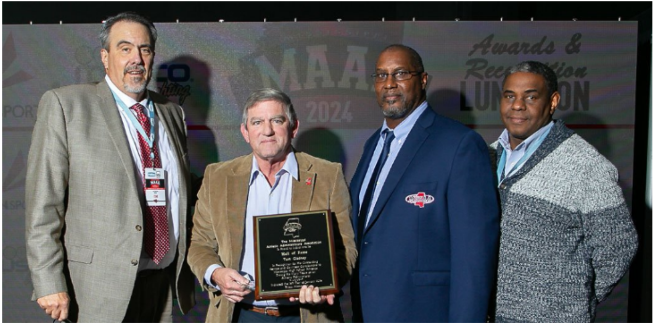
2024 MAAA Conference in Biloxi, MS.

January 18, 2024 | MAAA, News | 209 Views